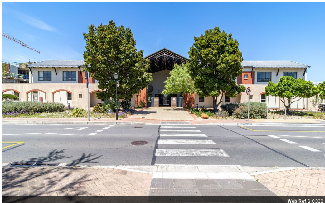
Web Ref SIC330

8 St Johns Road Corner Main Road Sea Point Cape Town South Africa