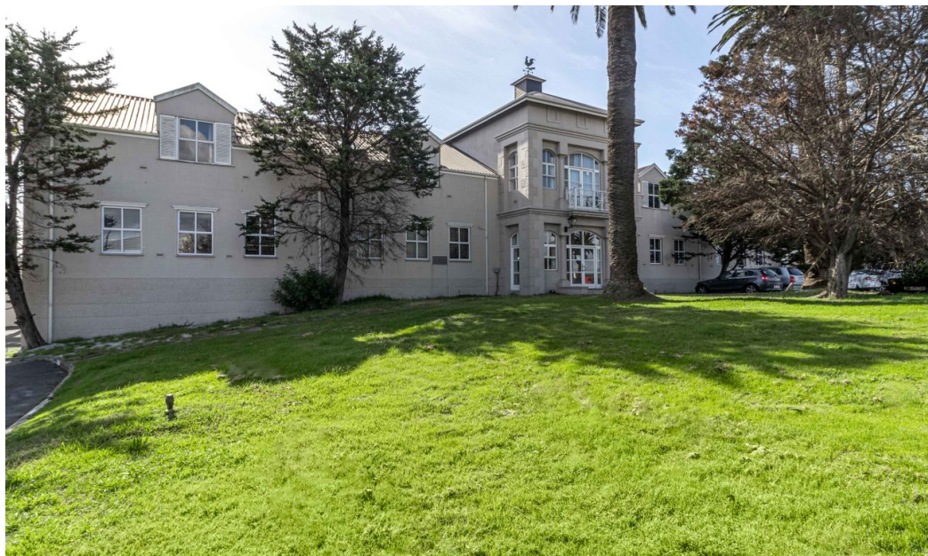
Web Ref SIC261

8 St Johns Road Corner Main Road Sea Point Cape Town South Africa