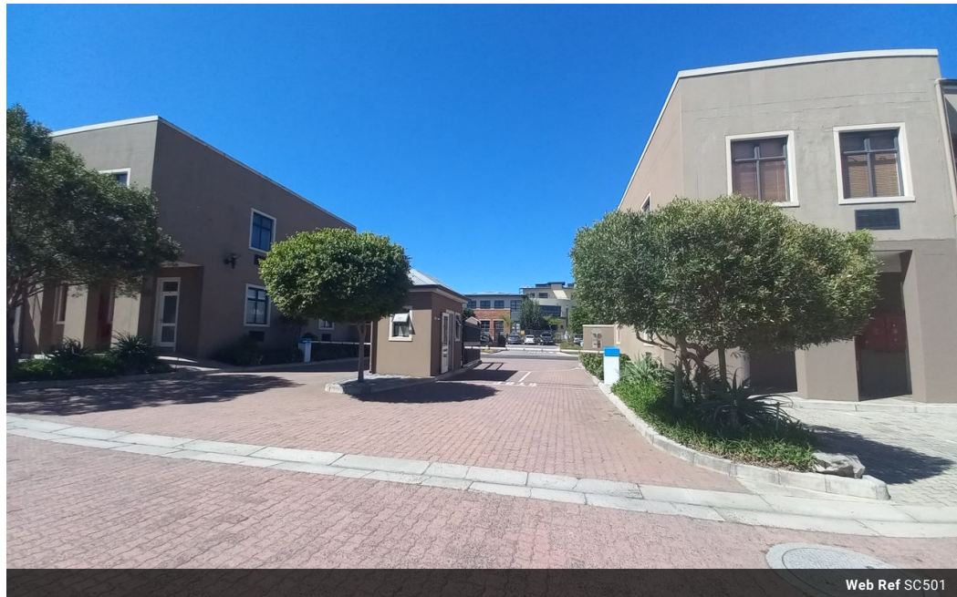
Web Ref SC501