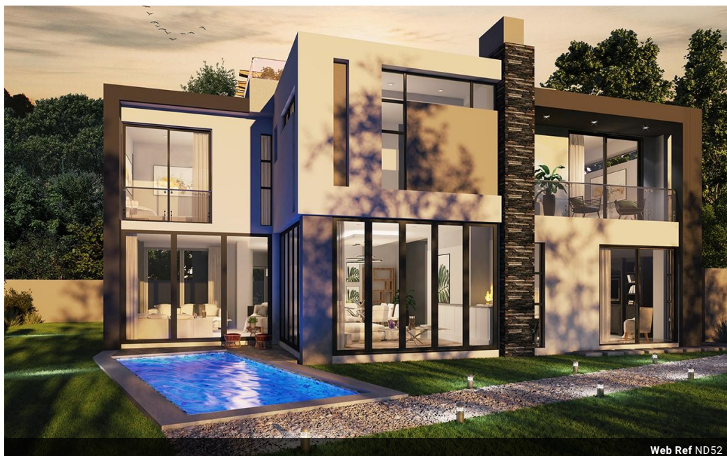
Web Ref ND52